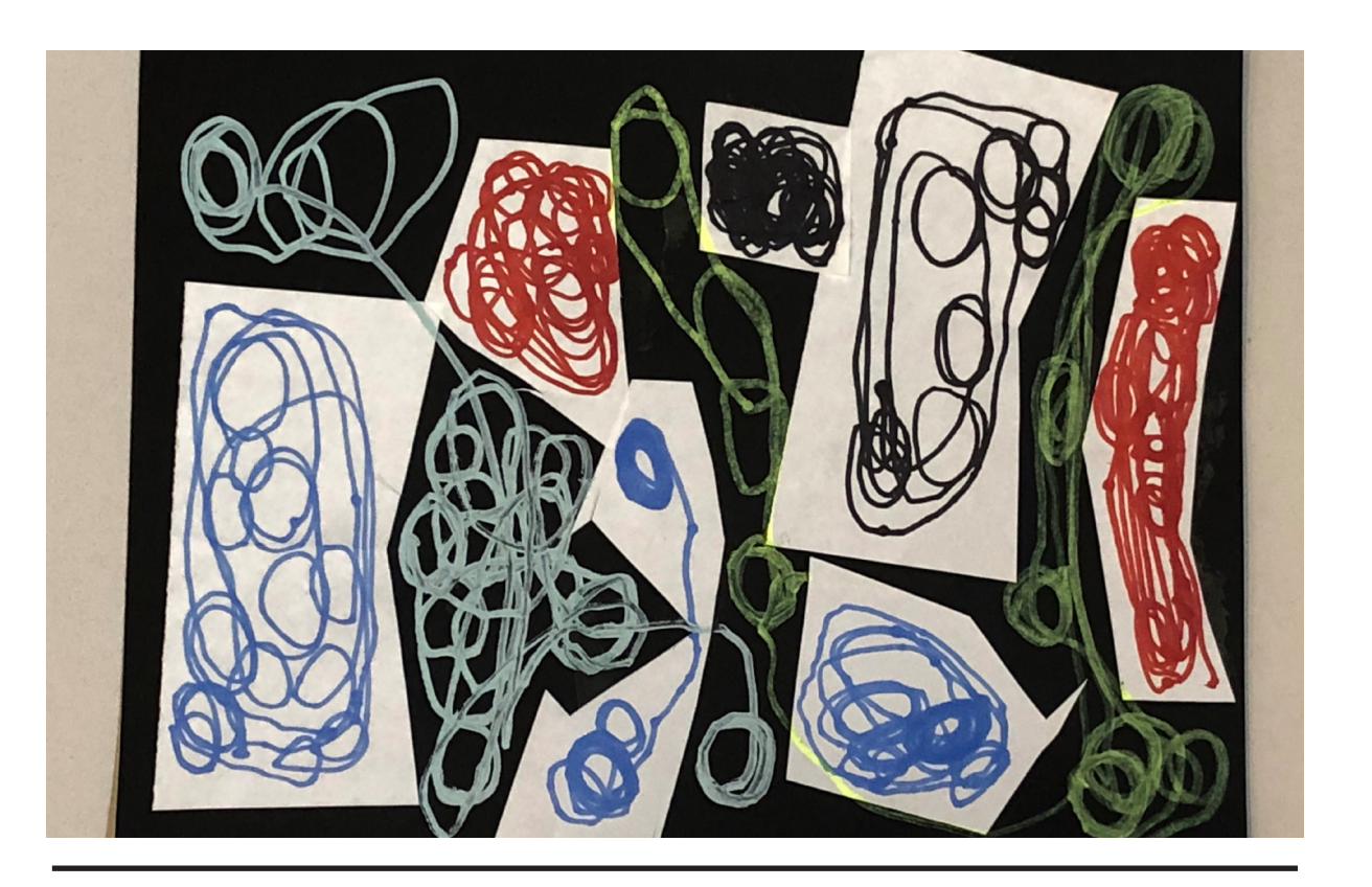
Five questions for... NANETTE KELLEY / cont. from p. 7

ration process, which was inclusive of a cross-section of cultures and eras. The exhibition was curated for Indigenous women in a respectful way, through an Indigenous lens, and by Indigenous women who are respected within their own communities and the art world.