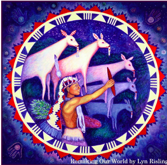
Remaking Our World by Lyn Risling

Seventh Generation Fund and the Ink People Center for the Arts. The goal of this collaboration was to feature the creative spirit of Native people, and the healing spirit of art itself. The current iteration of these exhibits strives to help rekindle that healing energy for us all.