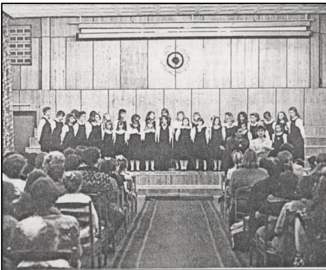
Children's Chorus members perform in Leningrad

represent World Harmony and truly uphold Kodaly's deepest conviction. At the time, I had no idea how to go about this monumental task nor whom to contact. Yet within a week dedicated parents were completely involved setting up fund-raising efforts and organizing publicity. Friendship Ambassadors Foundation represented exactly what we needed, both philosophically as well as with the arranging of our concert tour.