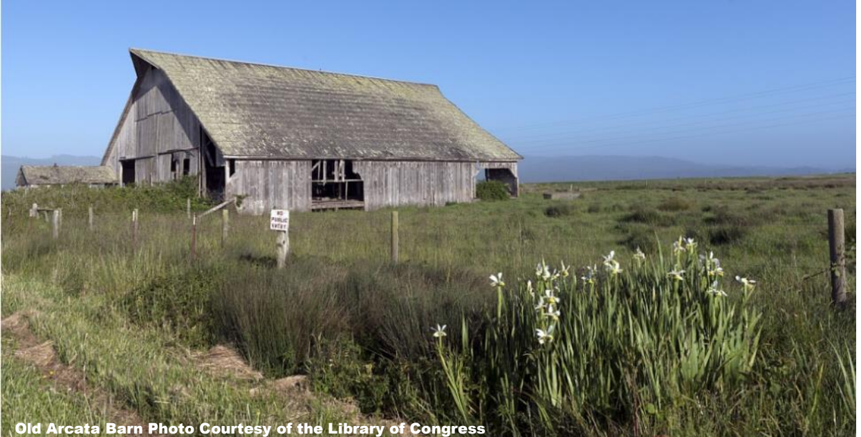
Old Arcata Barn