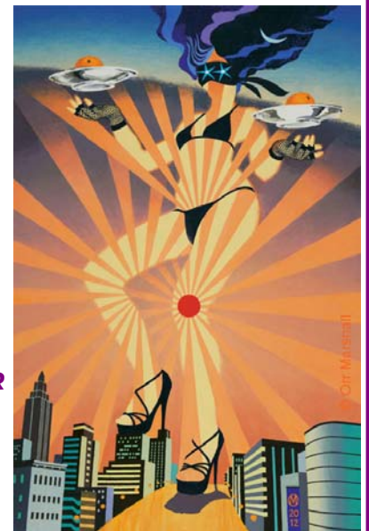
"Justice" by Orr Marshall

Twenty two Ink People artists explore the archetypes of Tarot.