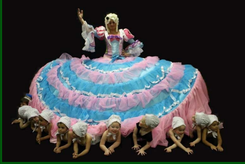
Mother Ginger and her Bon Bons (left)