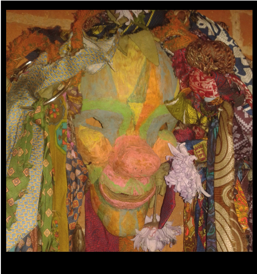
Best Mask in Show

This October the Brenda Tuxford Gallery celebrates the ancient tradition of donning other identities through masks. Maskibition is an open juried show featuring masks of all sorts. On exhibit will be award-winning masterpieces from local artists, prodigious works from local elementary schools, costume pieces from the Kinetic Grand Championship kinetic sculpture race, and more!