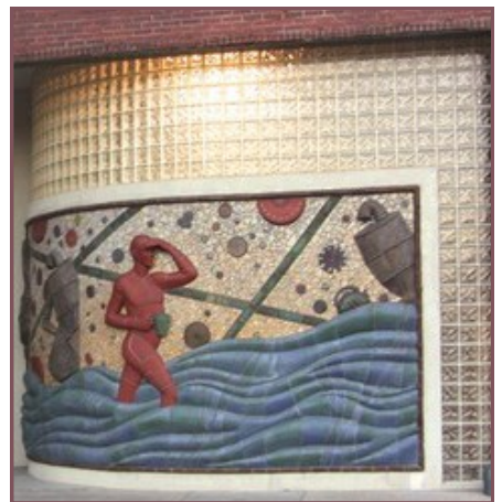
Odyssey Center for Ceramic Arts Asheville River Arts District