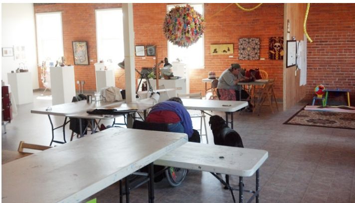
Brenda Tuxford gallery and Art Space on the second floor of the Healy building in Old Town.Eureka (see article page 5)

Media & Arts Resource Zone (MARZ) project: Tuesdays through Fridays, 3-6 p.m. at The Ink People . We work with youth to develop leadership and job training skills and to deepen community connections by focusing on the core fields of video documentary making, music, art, creative writing and much more.